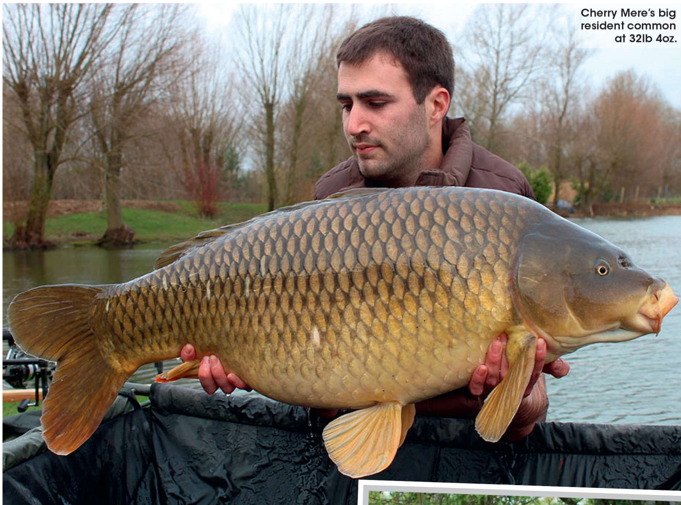
Cherry Mere's big resident common at 32lb 4oz.

but with some extremely big rewards for those who get it right, including over 100 twenties, a good head of thirties and the venue record 40lb 4oz common!"